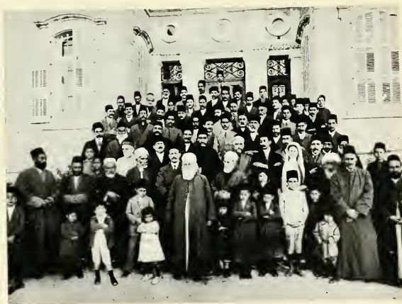
ABDUL BAHÁ WITH A GROUP OF BAHÁIS AT HIS HOME IN HAIPA